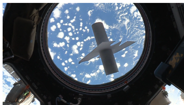
Eduardo Kac, Inner Telescope in the cupola, International Space Station (2017)

Kac's experiences with Alba prompted him to develop a wordless language incorporating rabbit images which he calls lagolyphs. The Lagoogleglyph painted in Finsbury Park is a large-scale version of one of these symbols, created specifically for this exhibition.