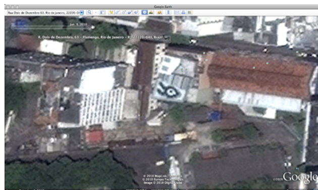
Lagoogleglyph I (2009) Google Earth work composed of Lagoglyph installed on the roof of Oi Futuro Rio de Janeiro, Brazil