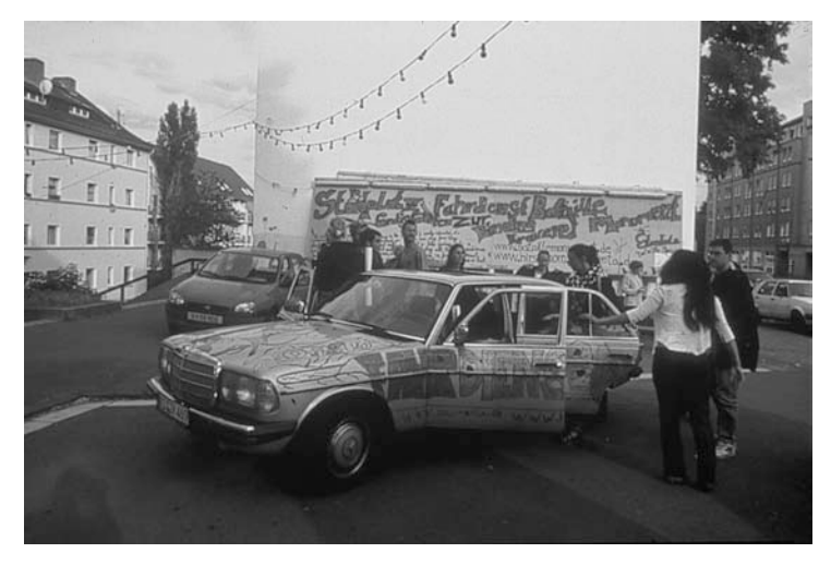
Thomas Hirschhorn. Right and facing page: Bataille Monument, Documenta XI, 2002.