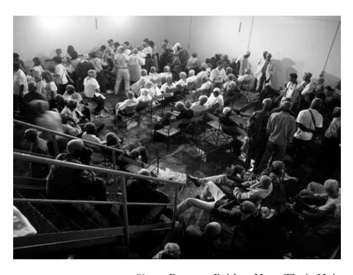
Sierra. Persons Paid to Have Their Hair Dyed Blond. Arsenale, Venice Biennale, 2001. Courtesy Lisson Gallery and the artist.

56. As Laclau argues, it is this "radical undecidability," and the decision that has to be taken within this, that is constitutive of a political society. See Laclau, Emancipation(s) (London: Verso, 1996), pp. 52–53.