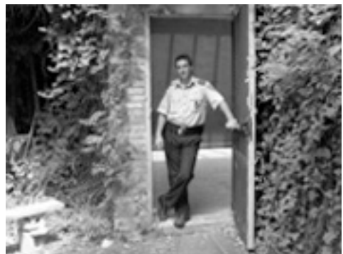
Sierra. Wall Enclosing a Space. Spanish Pavilion, Venice Biennale, 2003.

being fluid and unconstrained by exposing how all our interactions are, like public space, riven with social and legal exclusions.<sup>58</sup>