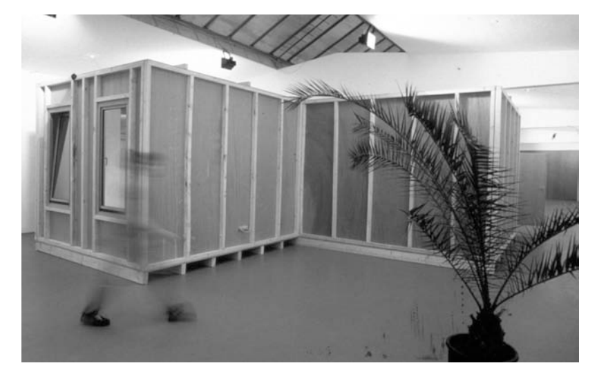
Tiravanija. Untitled 1996 (Tomorrow Is Another Day). Kolnischer Kunstverein, Cologne, Germany, 1996.

tion/performance was undertaken in Untitled (Tomorrow Is Another Day) (1996) at the Kölnischer Kunstverein. Here, Tiravanija built a wooden reconstruction of his New York apartment, which was made open to the public twenty-four hours a day. People could use the kitchen to make food, wash themselves in his bathroom, sleep in the bedroom, or hang out and chat in the living room. The catalog accompanying the Kunstverein project quotes a selection of newspaper articles and reviews, all of which reiterate the curator's assertion that "this unique combination of art and life offered an impressive experience of togetherness to everybody." Although the materials of Tiravanija's work have become more diverse,