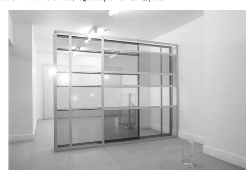
Gillick. Revision/22nd Floor Wall Design. 1998.