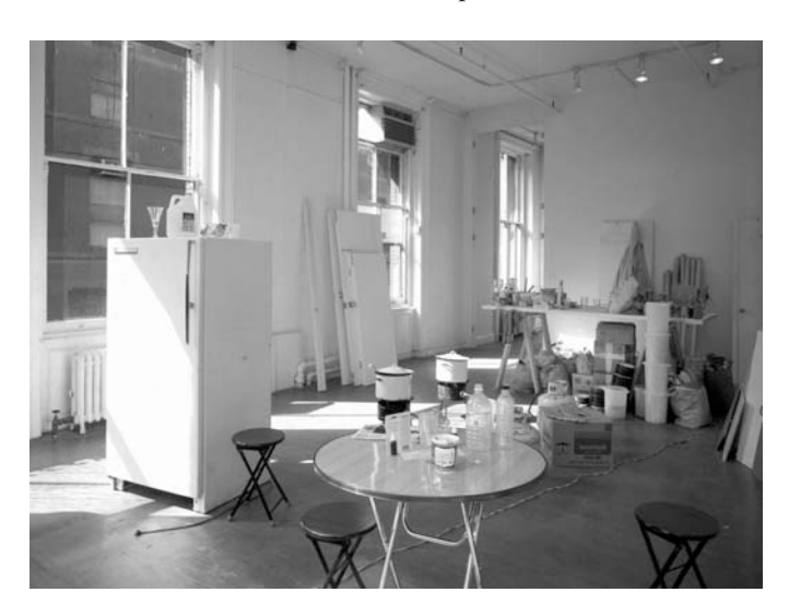
Rirkrit Tiravanija. Untitled (Free). 303 Gallery, New York, 1992.

hybrid installation performances, in which he cooks vegetable curry or pad thai for people attending the museum or gallery where he has been invited to work. In Untitled (Still) (1992) at 303 Gallery, New York, Tiravanija moved everything he found in the gallery office and storeroom into the main exhibition space, including the director, who was obliged to work in public, among cooking smells and diners. In the storeroom he set up what was described by one critic as a "makeshift refugee kitchen," with paper plates, plastic knives and forks, gas burners, kitchen utensils, two folding tables, and some folding stools. <sup>14</sup> In the gallery he cooked curries for visitors, and the detritus, utensils, and food packets became the art