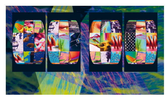
Tracking Pattern (2017) Katriona Beales

the edges of an embedded screen. A video installation, reminiscent of a fruit machine, displays a drum of hypnotically spinning images whose rotation is triggered by the movement of gallery visitors. Beales recreates