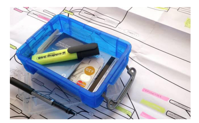
Heath Bunting, Proto-type Off-the-shelf (OTS) British Anonymous Corporation, 2014.

'official identities', what Bunting describes as "an expert system for identity mutation". It is an identity created for anonymous corporations that consist of non-natural person members.