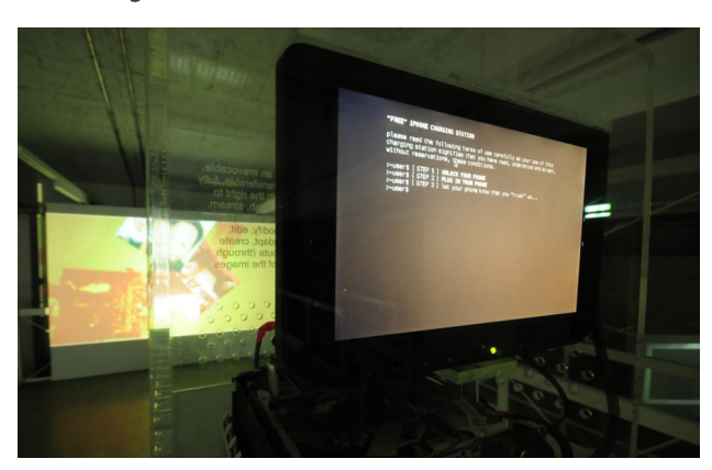
Branger_Briz, A Charge for Privacy, 2011.

Nothing online is really "free". We often forget (or might not even realise) that the online services we depend on for our most intimate and private exchanges (Facebook, Gmail, etc) are not exactly "free", nor are they exactly "private". Every word you email to your family and every link you share with your friends is being archived, indexed and monetised, either in the form of targeted ads and/ or other data-mining ventures.