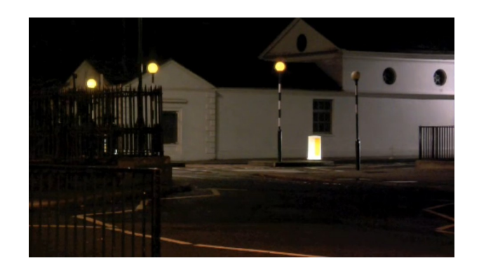
Belisha Code [http://lumiere-et-son.blogspot.co.uk/2009/12/belisha-code.html]

Note that there are four beacons. The sound (a numbers station, one can almost track the archaeology of impulse!) draws on the numbers 0-9, in German. It's worth