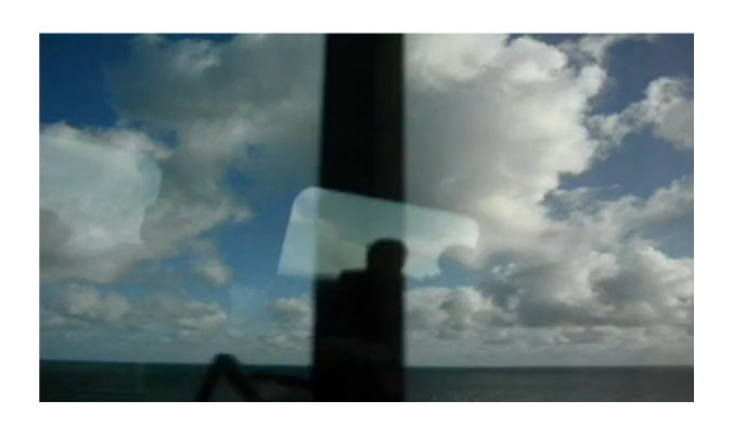
Time Travel [http://lumiere-et-son.blogspot.co.uk/2010/02/time-travel.html]

There is a hint of the transcendent in the title – how is this realized? Unless we know Denmark it takes a few moments to realize we are on a train rather than a boat or plane – we are clued into this by the close objects we clearly pass at speed and the reflection of passengers and seating in the windows. One