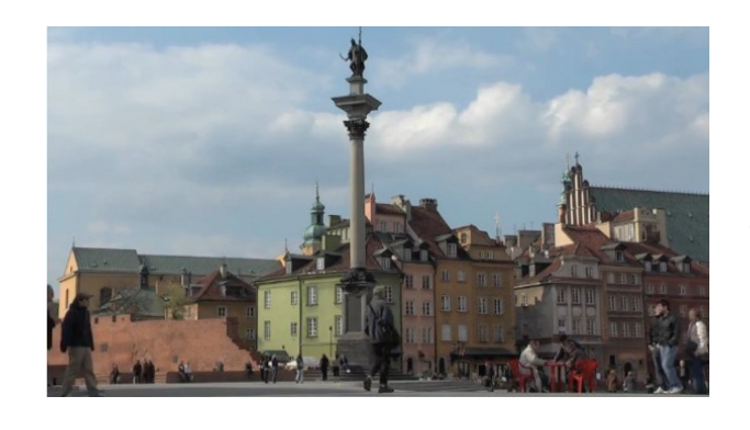
Square Dance [http://lumiere-et-son.blogspot.co.uk/2010/05/sqaure-dance.html]

Again a dance related piece – the regular beat of the calling of the numbers one to eight sets up an aural grid against with which the implicit rhythms of the movement in, out and across frame interact in a sophisticated but subtle polyrhythm. Part two of the sound, with actual step