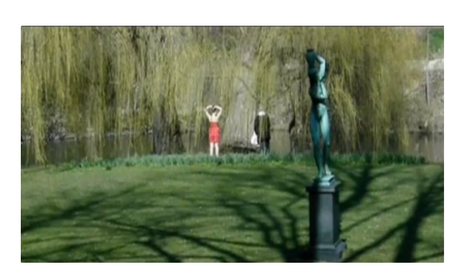
Spring Greens http://lumiere-et-son.blogspot.co.uk/2010/02/spring-greens.html

If one didn't know it wasn't one would surely assume this was carefully planned, and our knowledge it was not adds to our pleasure in it. Visually the rhyme between the woman and the near foreground statue is perfect - at one point she seems to mirror it exactly. Maybe she knows the area well