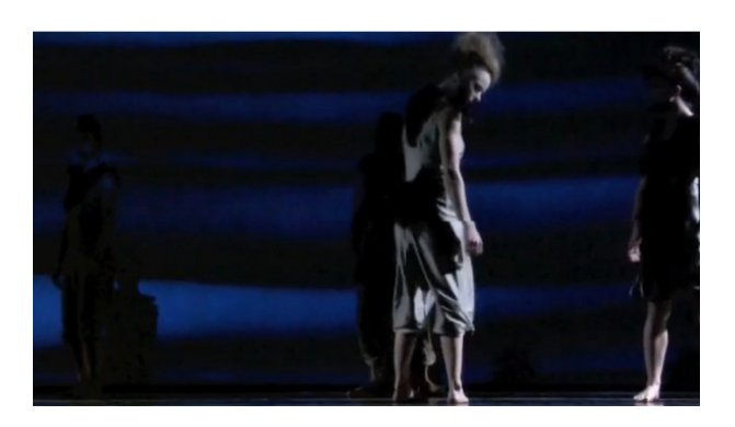
Shuffling Off [http://lumiere-et-son.blogspot.co.uk/2010/11/blotting-paper.html]

A one liner, but, given its place in the sequence, none the worse for it. Brass band/Dancers.