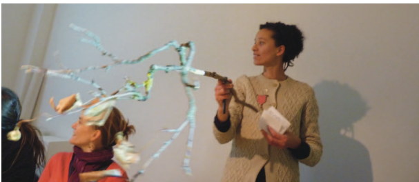
The Witches and 3-Keys workshop at Furtherfield Gallery, The Hexists , 2012

3 Keys - The River Oracle with The Hexists is a game of chance, and divination in association with Moving Forest, Act 0 ( www.movingforest.net ). It attempts to invoke the relationship between the divinatory functions of our contemporary 'influencing machines' (cybernetic systems and game theory using data-mining, data profiling and data protection) and traditional magical ones, creating new machines in the process. Using tools such as cards, dowsing, stick throwing to interpret phenomena in the landscape, historical and current, 'readings' can be cast, allowing associative action, language and thought to determine what might happen in the future, to create a path, an artwork.