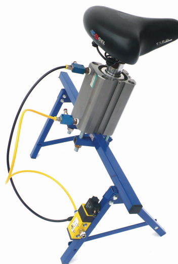
Expenditure Rider , YoHa, 2011

midwives and women in labour. “Databases move through us, allowing new forms of power to emerge... [they] order, compare, sort and create new views of the information they contain. New perspectives amplify, speed-up and restructure particular forms of power as they supersede others.”