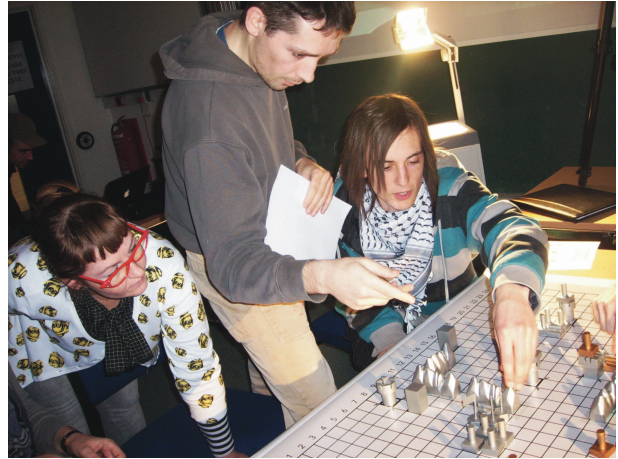
Playing Guy Debord's The Game of War , Class Wargames