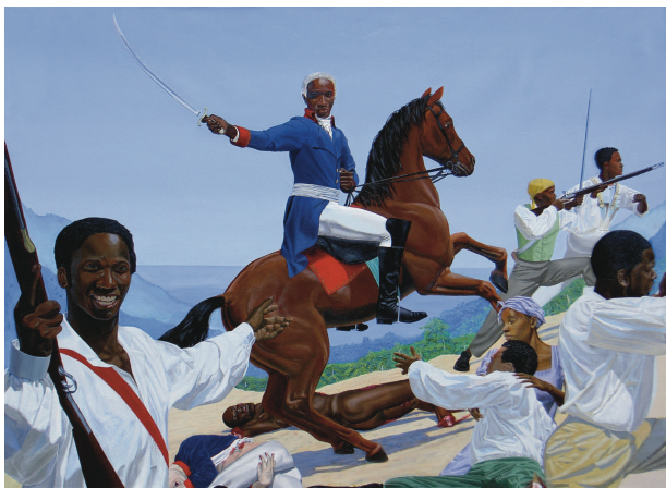
Toussaint L'Ouverture at Bedourete , K Donkor, 2004, oil on linen, 136 x 183cm

The Internet – a world-spanning database with billions of creators – shapes and reflects the production of social, political and economic realms by the prevailing powers and those actively resisting them. The Arab Spring, the Occupy movement, Anonymous and Wikileaks show how increased access to tools, debate and distribution of culture has motivated and enabled new forms and styles of individual and collective action, changing how agency is perceived and politics is done.